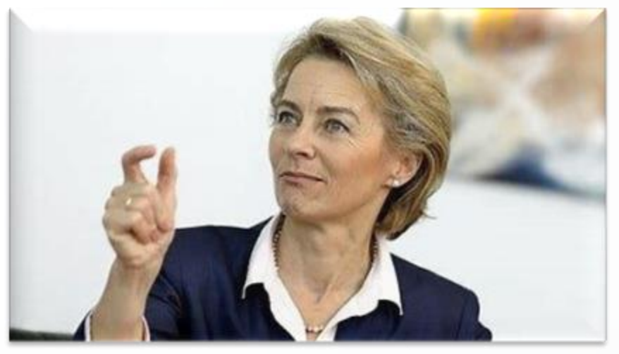
Ursula Van der Leyen, First female President of the European Commission

• Broad Application : Gender mainstreaming is integrated into all EU policies and programs, including space.